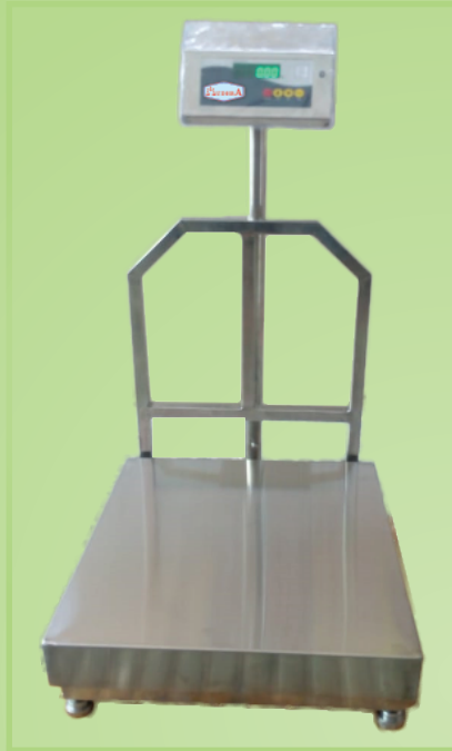
FULLY SS304/SS316 PLATFORM