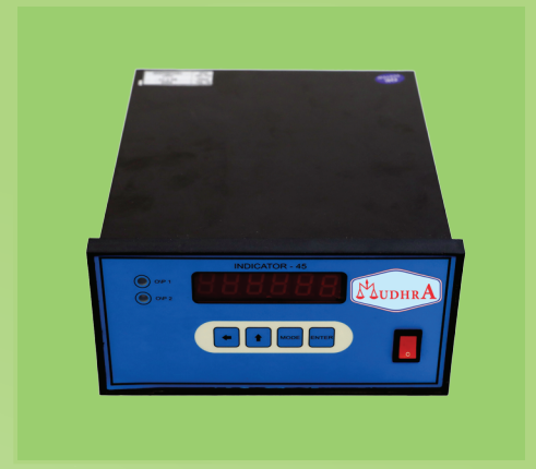
RELAY OUTPUT INDICATOR