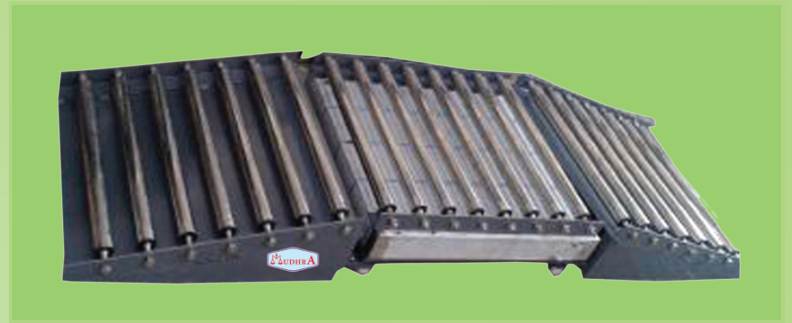
PLATFORM WITH ROLLERS ALONG WITH RAMPS